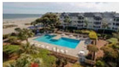
Port O' Call