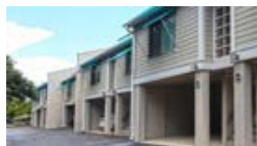
Beach Club Villas

A Wild Dunes Sports Card is something that is available for rental property owners to purchase at the beginning of each season. Properties that have a Sports Card allow the guests that stay there to have access to the fitness center (for a fee,) as well as the tennis courts and additional pools in the resort!