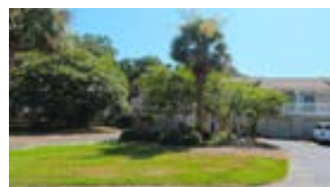
Fairway Dunes Villas