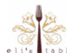
Eli's Table 129 Meeting St. High-End Southern