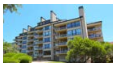
Ocean Club Villas