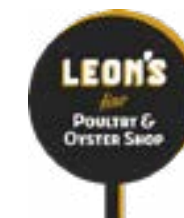
Leon's 698 King St. Oyster Bar